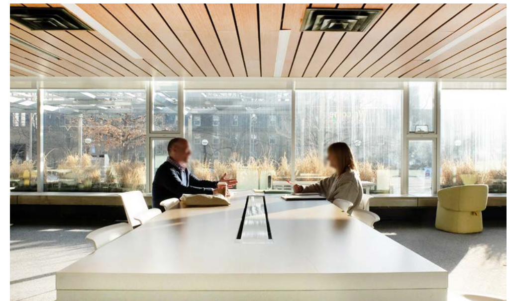
Large Table Seating Area