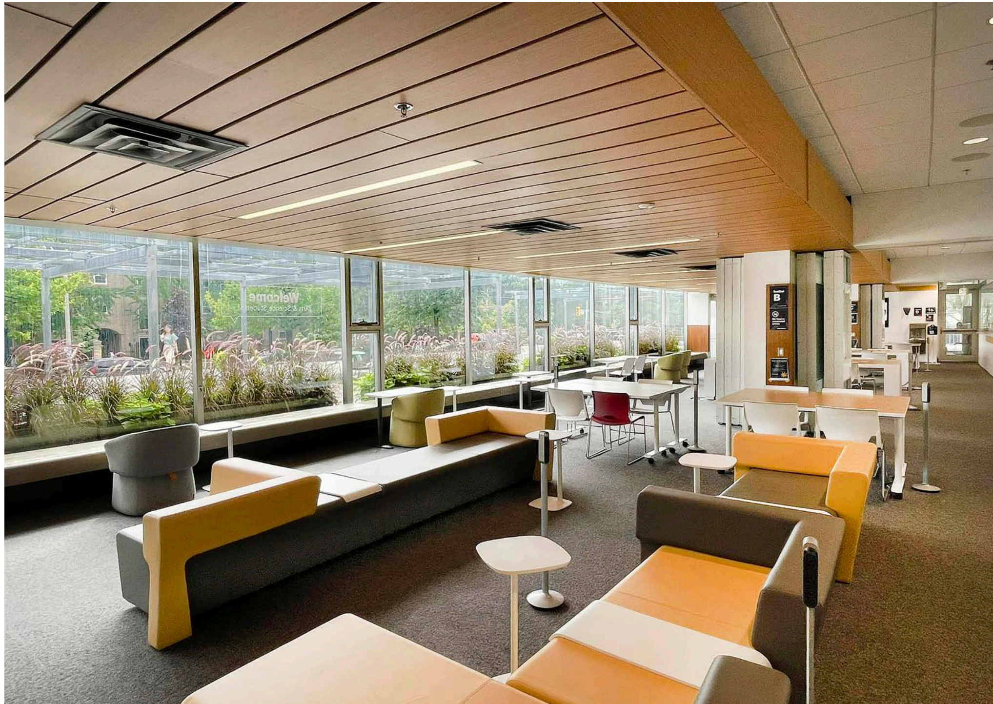
Lounge Seating Area