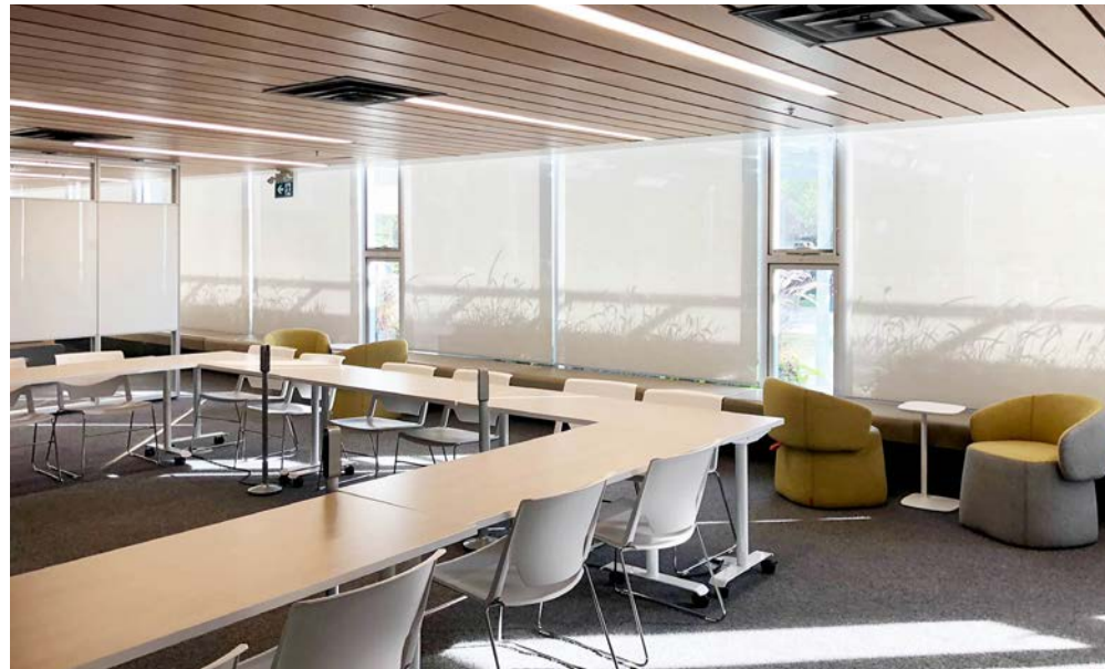
Group Meeting Configuration