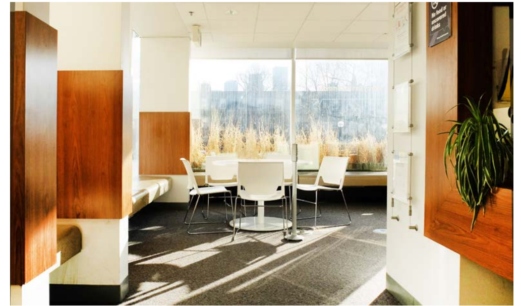
Corner Table Seating Area