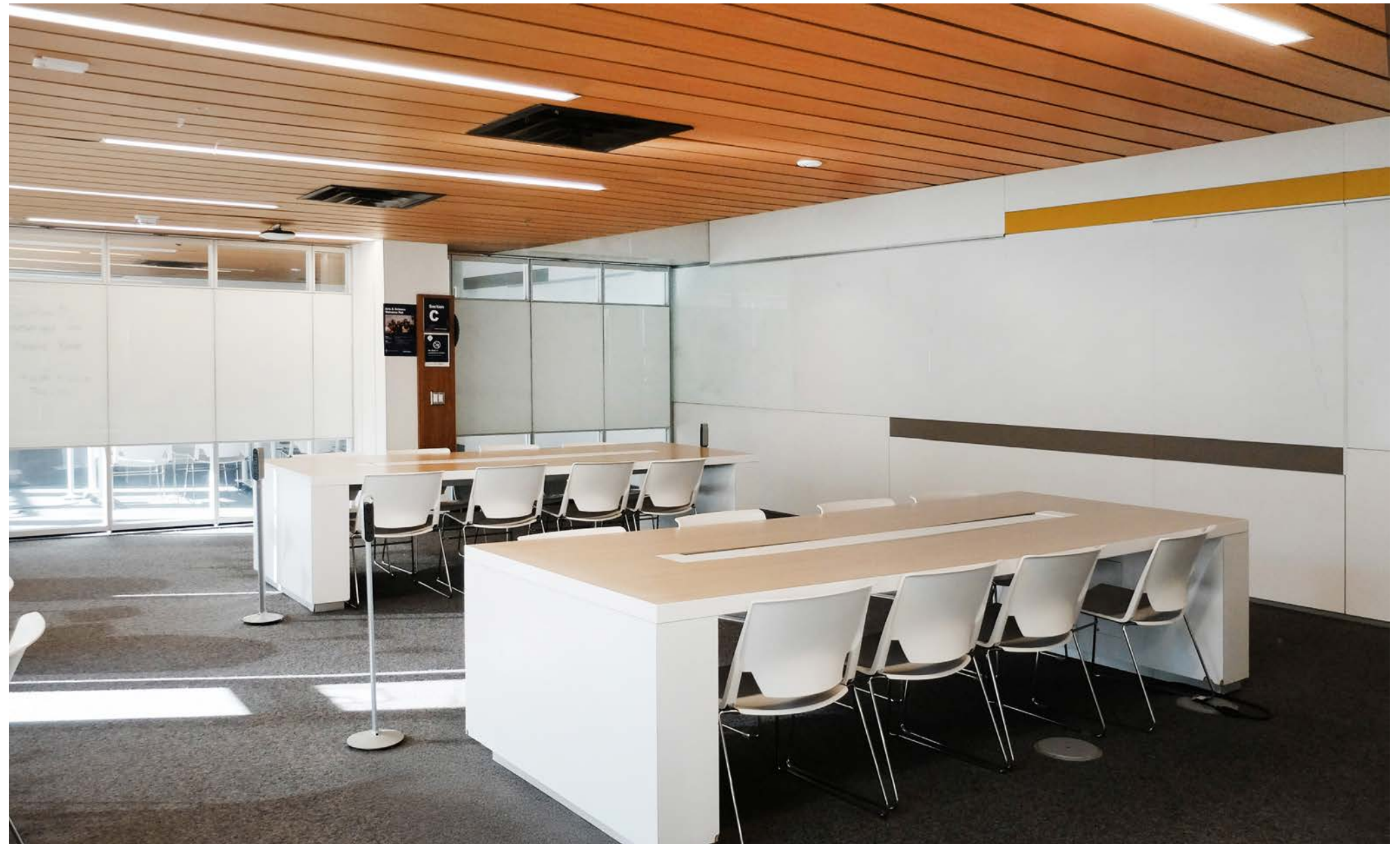
Multiple Group Seating Configuration

Flexibility the space accommodates a variety of program types and scales—from open workstations to intimate group meetings—through the use of movable partitions and integrated technology hubs featuring charging stations, wall-mounted screens, and large whiteboards