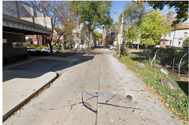
Google Image Oct 20120, laneway looking north

Programs and buildings flanking this section of the Living Lane that may help inform the proposal include: