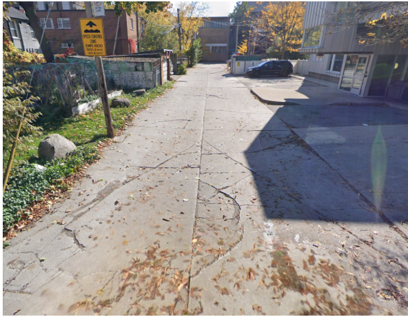
Oct 2020, laneway looking south